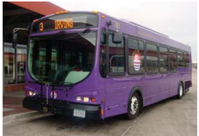
One of Pueblo's new beauties ready to roll.

The new buses will be placed on different routes every day so the entire community will be able to benefit from and experience them. ▀